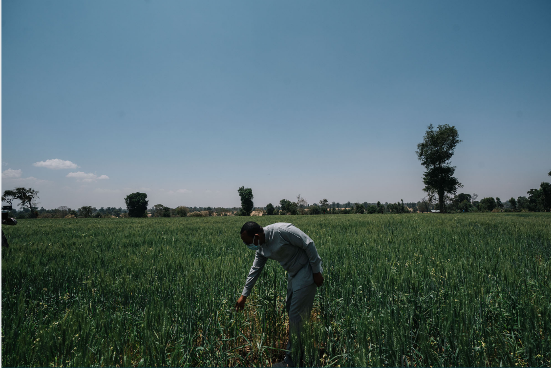
Summer wheat development for import substitution

Copyright © 2021 FDRE Office of the Prime Minister - All rights reserved Tel.: +251 111 400 740 | Fax: +251 111 226 292 | P.O.Box: 1031 Addis Ababa, Ethiopia Email: info@pmo.gov.et | Lorenzo Te'azaz Road