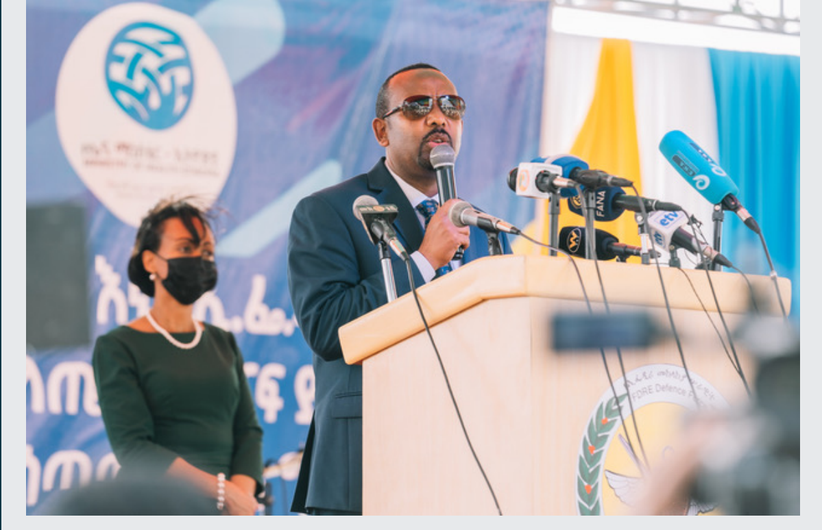
19 March 2022, Prime Minister Abiy Ahmed attended a ceremony held in honor of health professionals who served during 'Operation National Unity in Diversity' and thanked them for their exceptional service.