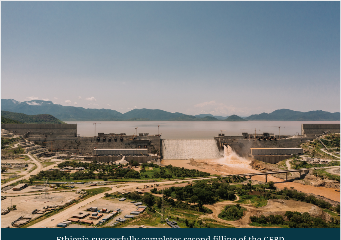
Ethiopia successfully completes second filling of the GERD