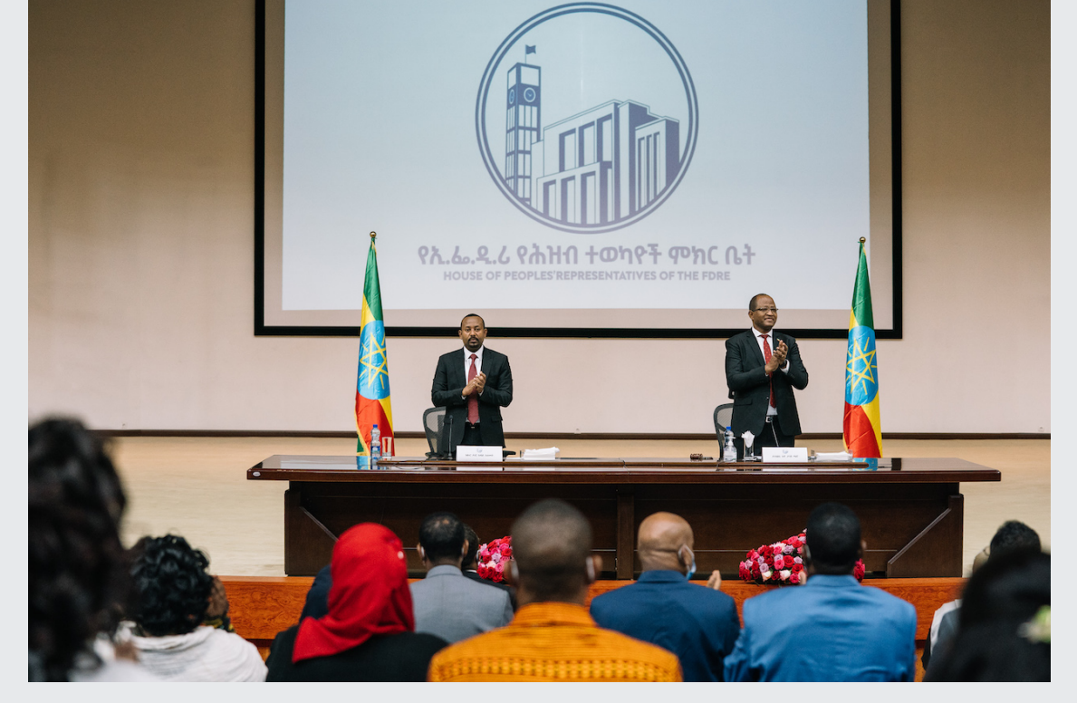
On 5 July 2021, Prime Minister Abiy Ahmed responded to questions raised by the House of People's Representatives in a special session convened before Parliamentary break. Watch the full English session here: <a href="https://bit.ly/3ydAw7c">https://bit.ly/3ydAw7c</a>

On July 22 2021, Prime Minister Abiy Ahmed convened the Council of Ministers in annual review of progress and milestones achieved during the course of the EC 2013 budget year. Some key milestones included remarkable progress over the past year of Agricultural crop productivity, particularly in Ethiopia's efforts to substitute wheat imports through enabling national productivity; positive performance of gold exports; strengthening and reach of other forms of health services alongside the nation's confrontation of COVID19 and 20% increase in export revenue.