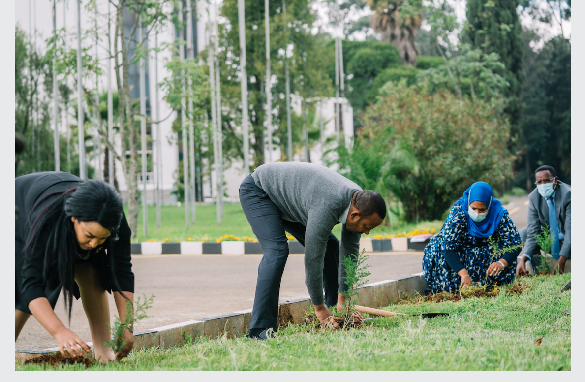
On July 23 2021, The Council of Minister's continued the annual review of sectoral performance and concluded by planning their green legacy together with Prime Minister Abiy Ahmed in the Office of the Prime Minister compound.

On July 27, 2021, the Press Secretariat Unit of the Office of the Prime Minister held the monthly Addis Weg discussion platform and the them 'A step forward in Democracy, implications of the 6th National Election'. The reflective session aimed to explore and draw lessons from Ethiopia's first attempt a free and fair election by examining the role of democratic institutions, preparedness of the Government's security sector; political party and civil society participation as well as the role of the media.