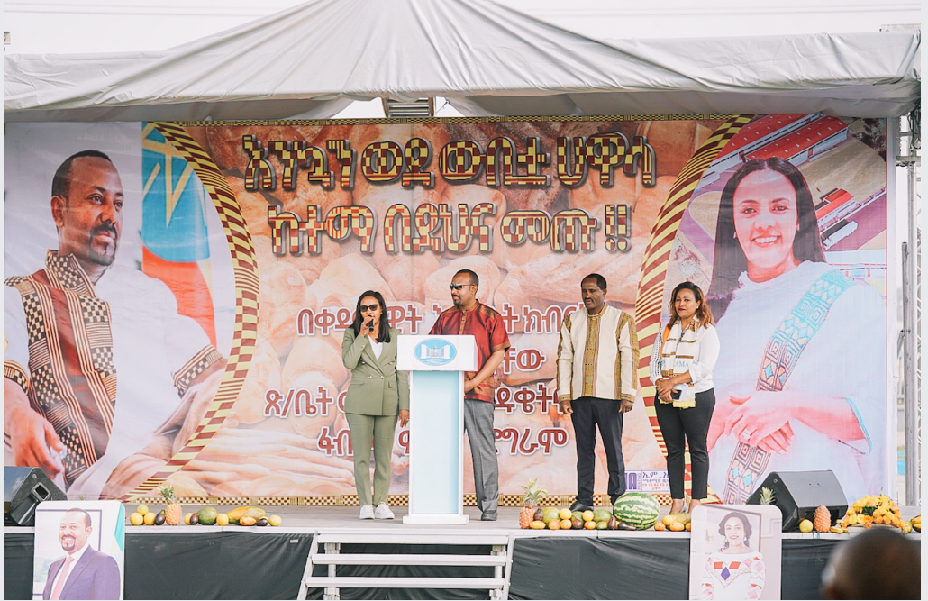
December 24, 2022: - The Office of the First Lady, inaugurated the fourth of eleven bread factories today in Hawassa city it the presence of Prime Minister Abiy Ahmed and high government Delegation. These bread factories being built throughout the country have a capacity of producing 300k bread per day, providing local communities affordable meal staples.