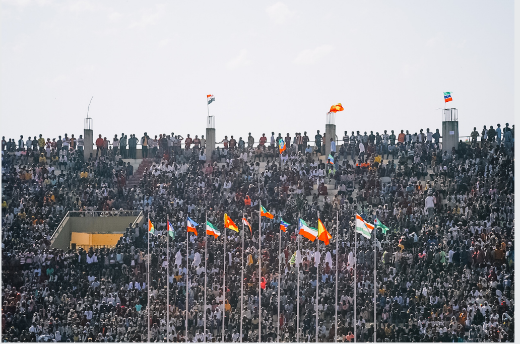
December 8, 2022:- Prime Minister Abiy Ahmed with high-level government delegation attended the 17 th Nation and Nationalities Day as celebrated in Hawassa City.