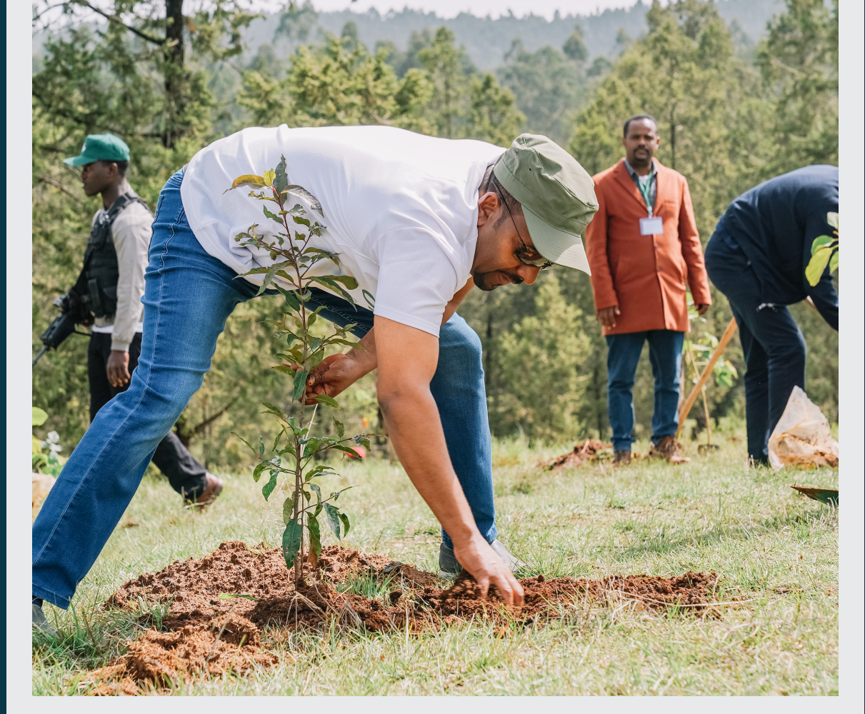
June 21, 2022, Green Legacy' planting program's fourth round began in the presence of Prime Minister Abiy Ahmed and senior government officials. Prime Minister Abiy urged citizens to plant 100 seedlings each, as he planted the first ten of his goal of 100 seedlings. The fourth round of Green Legacy is themed "Our Legacy for Our Generation."