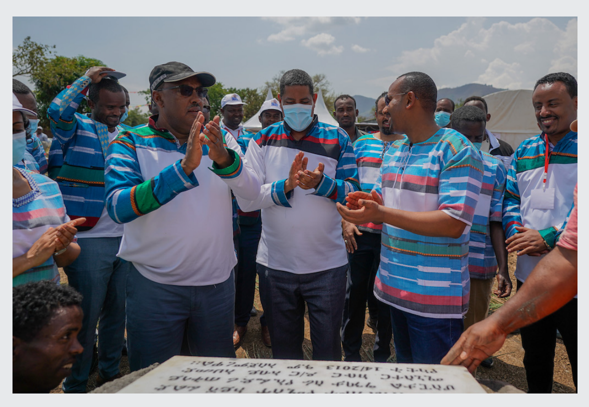
On February 23, 2021 Prime Minister Abiy Ahmed together with the Council of Ministers launched the construction of the 80km Chida - Jimma road which crosses through Jimma zone and ends in Konta special woreda.

On February 22, 2021 the Council of Ministers held a bi-annual review of national performance against established plans and goals set for the year. The review explored each ministry's key milestones over the past six months, enabling factors, critical challenges, social responsibility initiatives as well as works being undertaken by all ministerial offices in creating an ergonomic and conducive working environment.