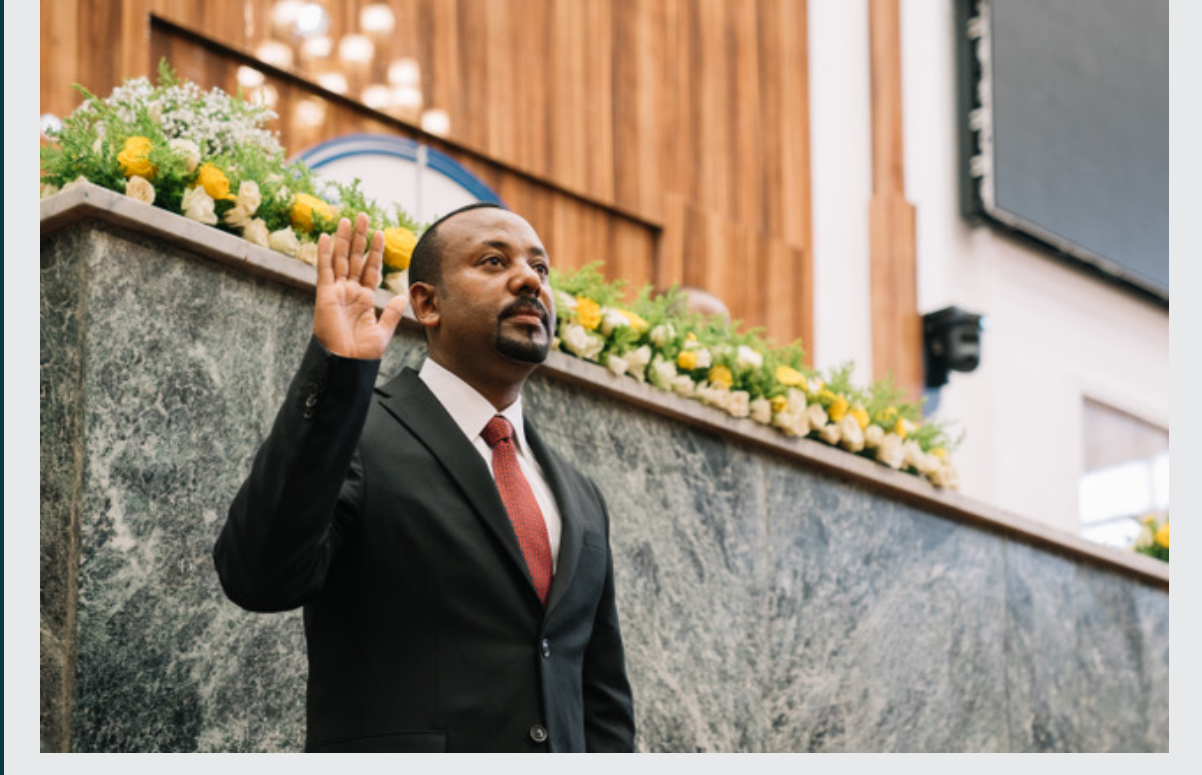
On 4 October 2021, Following the results of the sixth national election, the formation of the new government of the Federal Democratic Republic of Ethiopia took place. Prime Minister Abiy Ahmed was sworn in at the 6<sup>th</sup> joint session of House of Federation and the House of Peoples' Representatives.