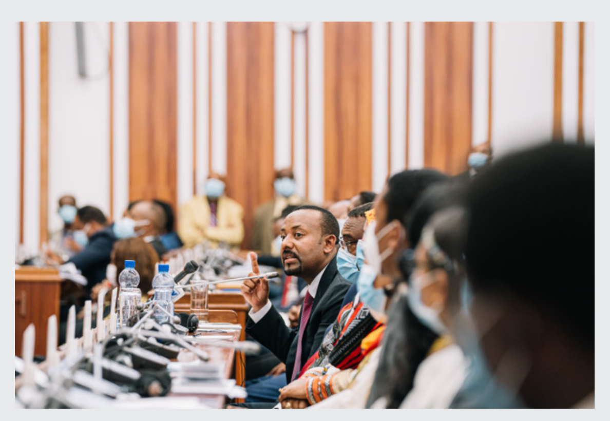
On 6 October 2021, Prime Minister Abiy Ahmed presented his proposal for members of the Council of Ministers during the House of Peoples Representatives session today. From 22 Ministerial portfolios, three proposed leaders represent competing political parties. Ethiopia's new beginnings is marked by commitment to inclusivity.