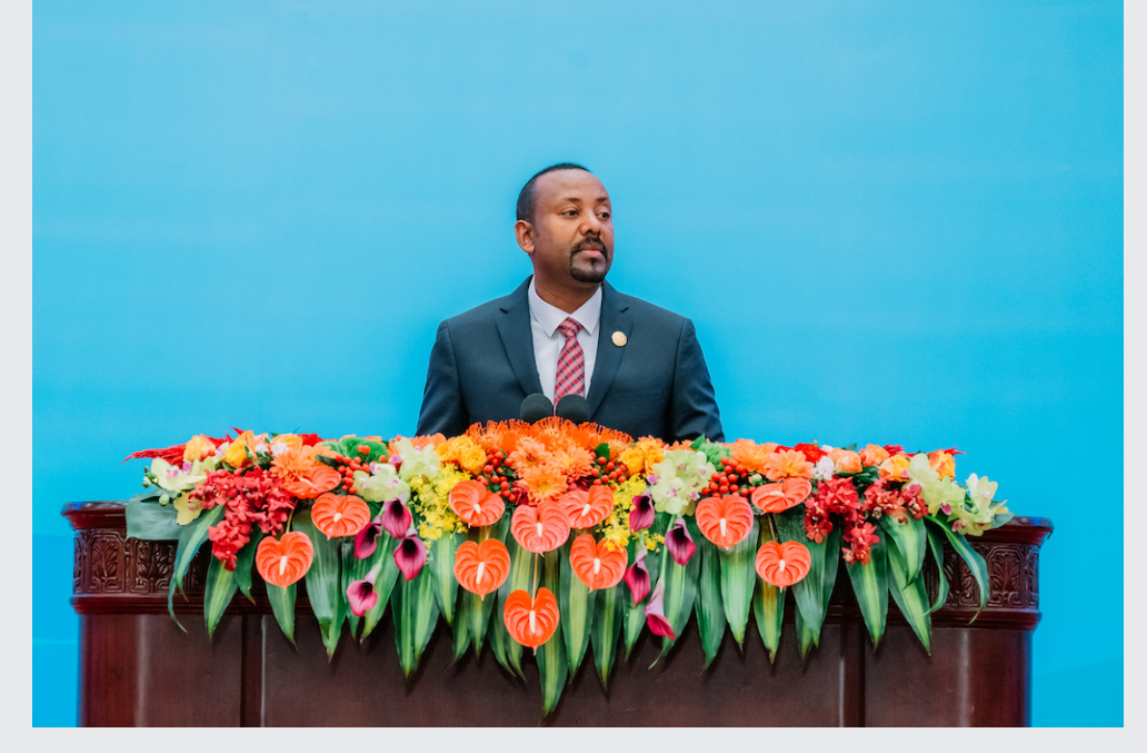
On 18th October 2023, Prime Minister Abiy Ahmed addressed the 3rd Belt and Road Forum during the Opening Session.

In his address, the Prime Minister shared the genesis of Sino-African relations and the strong basis for cooperation set by the BRI in infrastructure development within the African continent. He further highlighted Africa's growing influence citing the importance of ensuring multilateralism is inclusive.