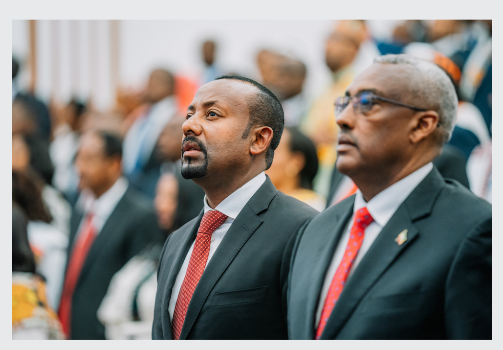
On October 9th 2023, Prime Minister Abiy Ahmed attended the official opening of the joint session of the third year and sixth tenure of the House of Peoples' Representatives of Ethiopia and the House of Federation.

On October 6th 2023, Prime Minister Abiy Ahmed extended best wishes for the celebration of Irrecha. In his message, Prime Minister Abiy noted that Ireccha is a festival of justice, equality, love and unity that demonstrates fraternity and solidarity among the people.