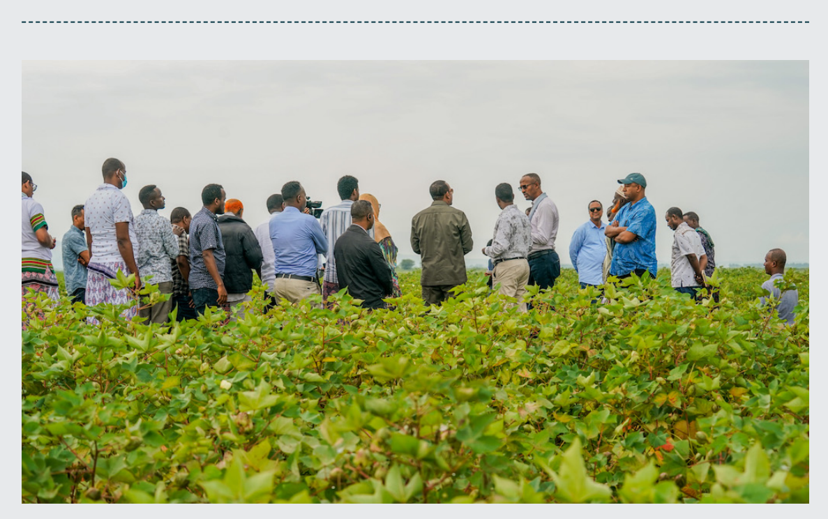
Sept. 21, 2022, Prime Minister Abiy Ahmed paid a visit to the Middle Awash area of the Afar Region. Despite the fact that the area has historically been prone to flooding, 20,000 hectares of land are now producing cotton. Fruit production will follow, aided by an improved irrigation system.

Sept. 16, 2022, Prime Minister Abiy Ahmed together with senior government officials visited a wheat cluster farm in the Oromia Region's Dugda and Bora zones. Prime Minister Abiy stated that during the new Ethiopian year, our country gets closer to meeting the goal of supplying export wheat.