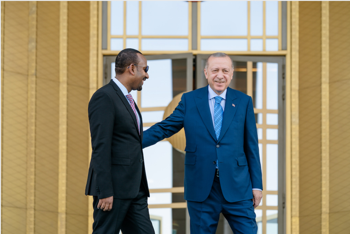
Prime Minister Abiy Ahmed received by Turkish President Recep Tayyip Erdoğan at the Presidential Compound in Ankara