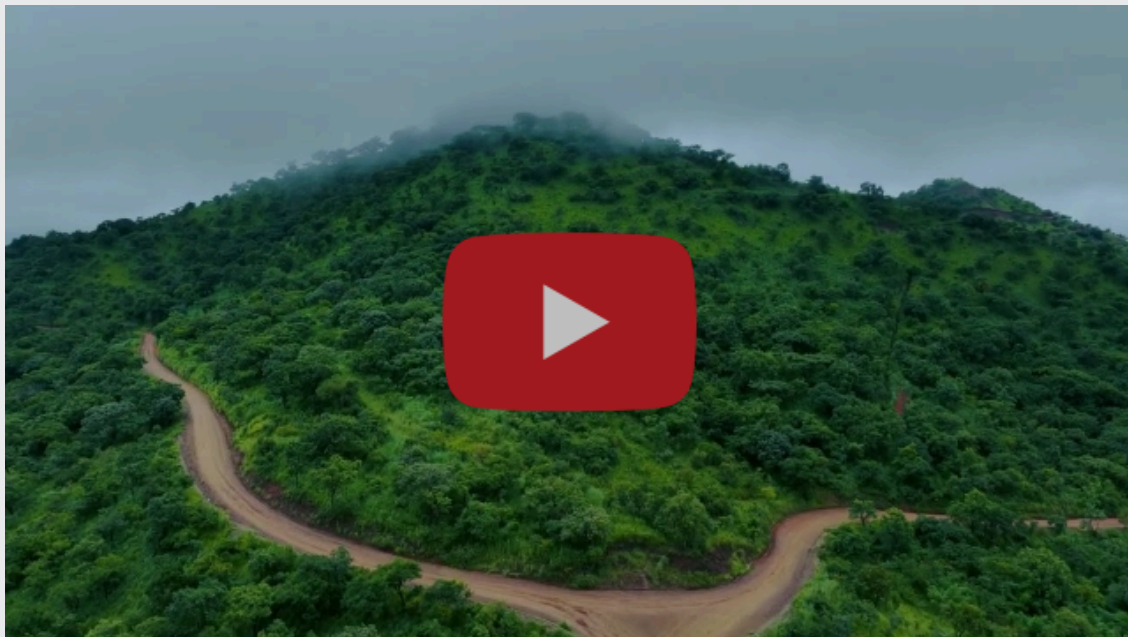
Benishangul-Gumuz: Flowing Rivers and Endless Green

Copyright © 2023 FDRE Office of the Prime Minister - All rights reserved Tel.: +251 111 241161 || +251 111 241182 || P.O.Box: 1031 Addis Ababa, Ethiopia Email: info@pmo.gov.et | Lorenzo Te'azaz Road